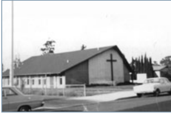
Original Auditorium 1979