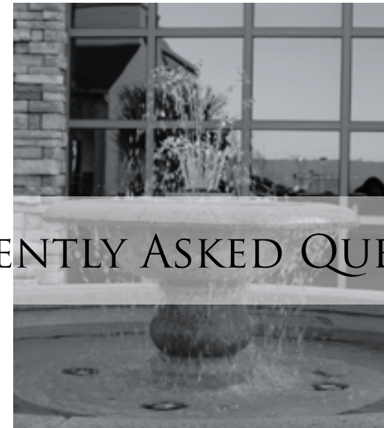
Clock Tower Fountain