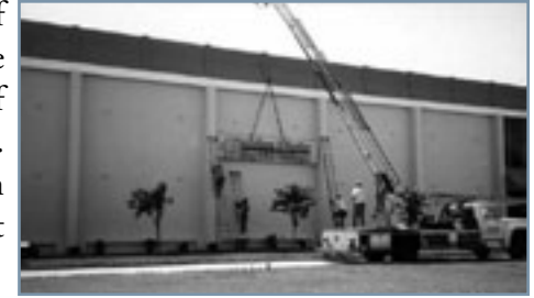
Opening of GSBC 1996

lished for this purpose. In May of 1995, we were able to witness the first commencement exercises of the Golden State Baptist Institute. Golden State Baptist College is an outgrowth of Golden State Baptist Institute.