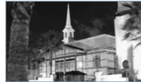
Auditorium Construction November 2003

This fall, GSBC will be celebrating her fourteenth year as an independent, fundamental Bible college. Since the foundation of this college, God has poured out His blessing on this school. The main academic building has